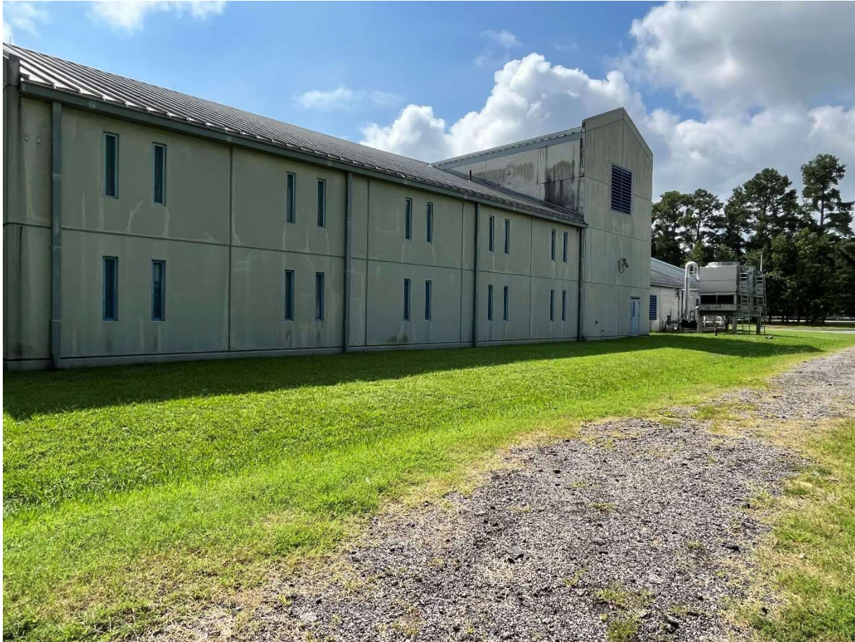
West end of facility