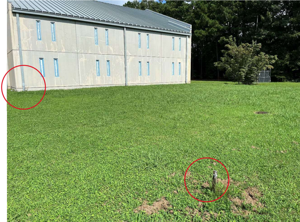
Front of facility - Corner