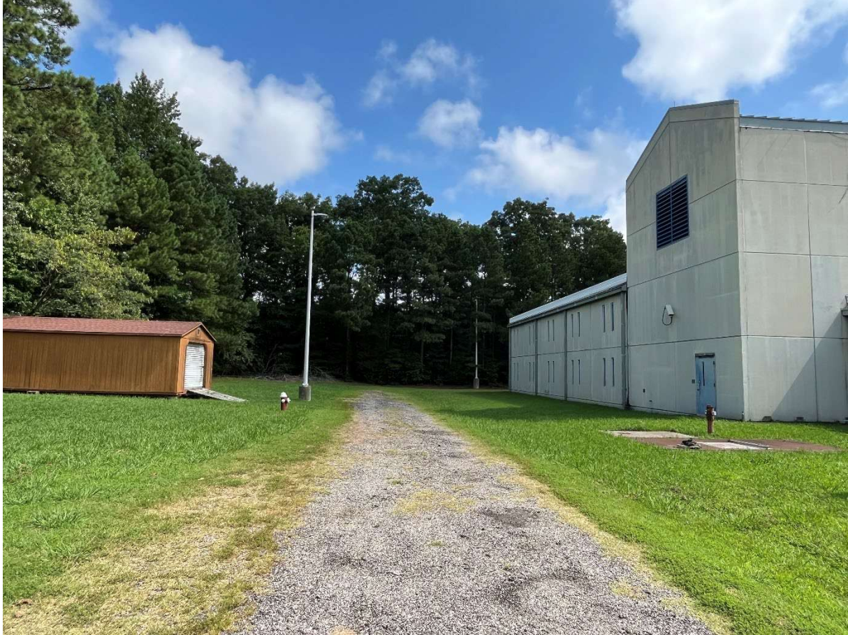
West end of Facility