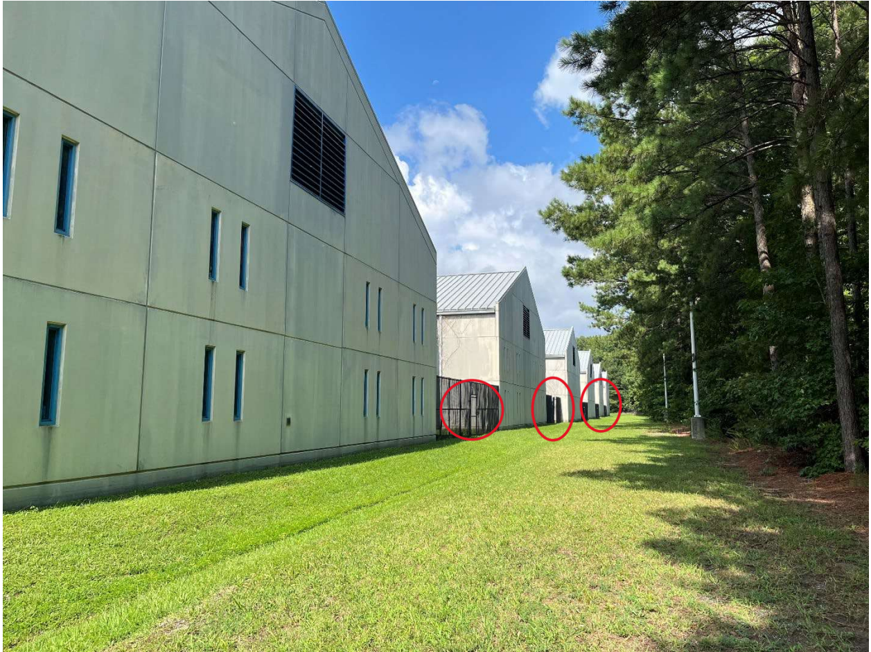
East end – 250' of existing fencing removed and replaced. Five (5) Sections